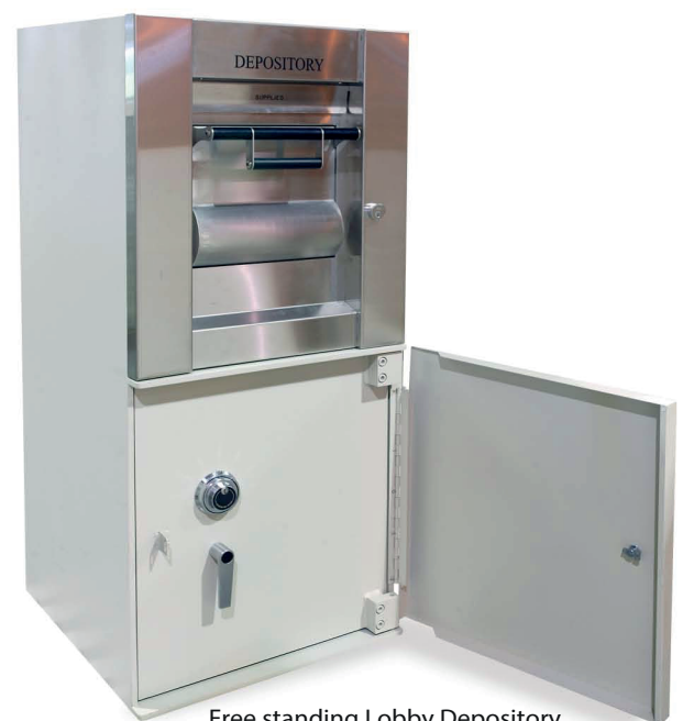
Free standing Lobby Depository